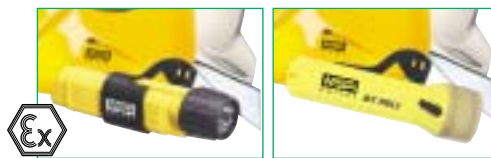
Intrinsically safe fire-fighter's lamps T2 and T4

The range of F1 Helmet System can receive respiratory masks with mask adapters or with mask bands.