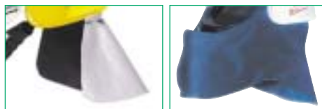
Aluminised or wool - Nomex neckcurtains